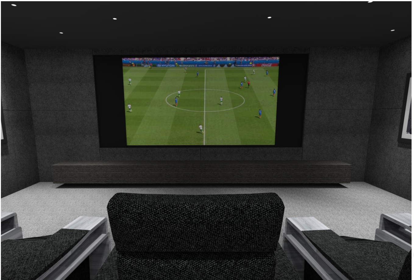
Dynamic-4-XL Screen - Front view

DYNAMIC-4-XL [DT-DYN-4-XL] - ON WALL PROJECTOR SCREEN WITH 4 WAY MOTORISED MASKING FOR VISIBLE SCREEN WIDTH GREATER THAN 420CM