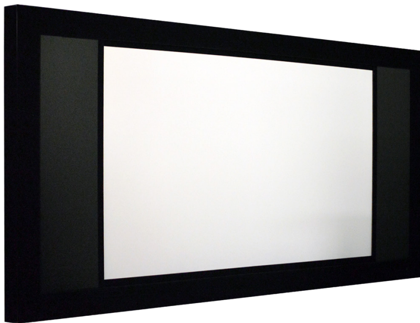
Example of Dynamic-2S-XL

The proprietary Whispertec motor system runs at just 30dB which makes the Dynamic-2S-XL the quietest masking screen in operation.