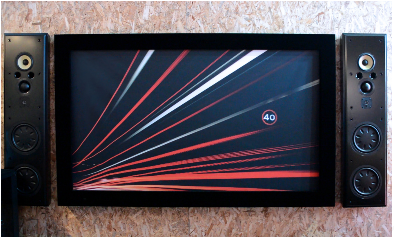
Dynamic-AM Screen - Front view