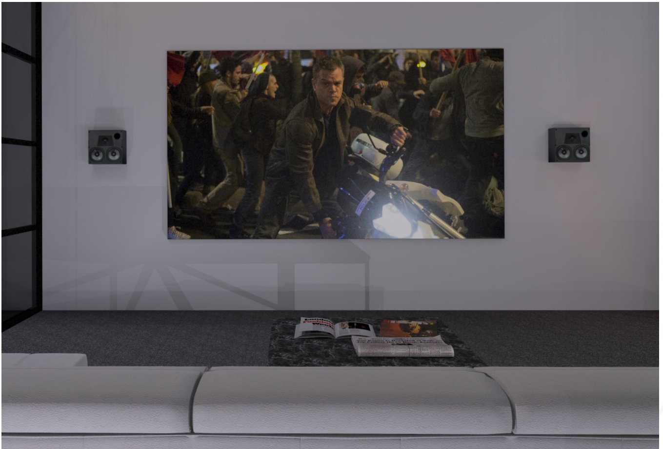
Contempo Screen - Front view