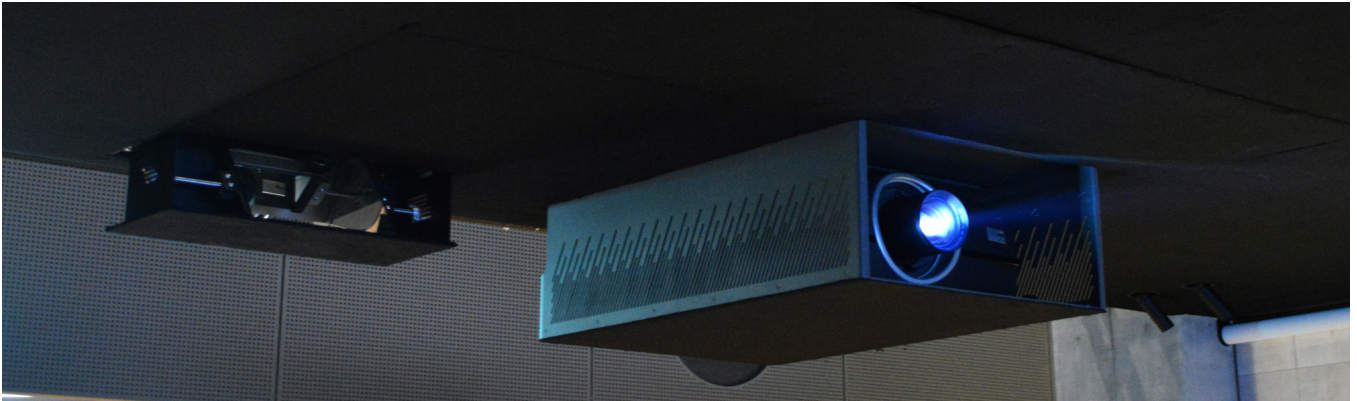
Motorised Mirror Drop (left) comparison- Front view

Featuring DT mounts Position Logic System (PLS) makes it straightforward to set exact stops and closed positions for simple recall via contact closure of RS232.